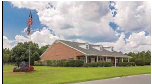
SEVEN LAKES 910-673-7300 md@bolesfuneralhome.com