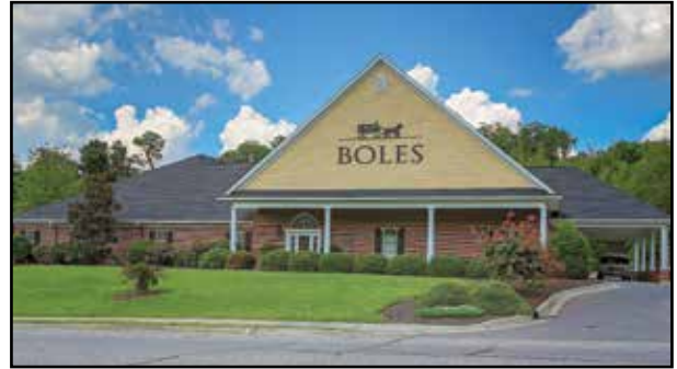
SOUTHERN PINES 910-692-6262 md@bolesfuneralhome.com