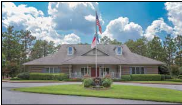
PINEHURST 910-235-0366 md@bolesfuneralhome.com